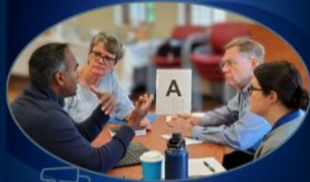
A conversation group facilitated by NACMS

One Great Family: Marianist Fraternity and Inclusion