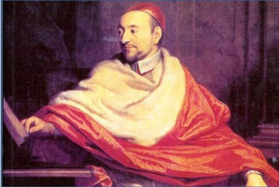
Pierre Cardinal de Bérulle

[from The New Dictionary of Catholic Spirituality , ed. Micael Downey (Collegeville: Minn: Liturgical Press, 1993), pp. 420-23.]